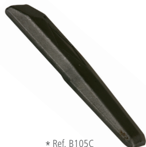
* Ref. B105C