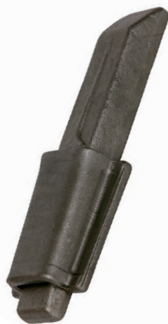
* Ref. B106A