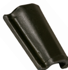
* Ref. B105D